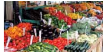
Retro clothing and fresh food—two of Kensington Market BIA's draws