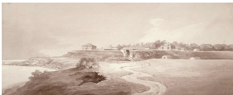
"The Fort at York" (1821)